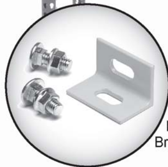
Flush Mount Bracket